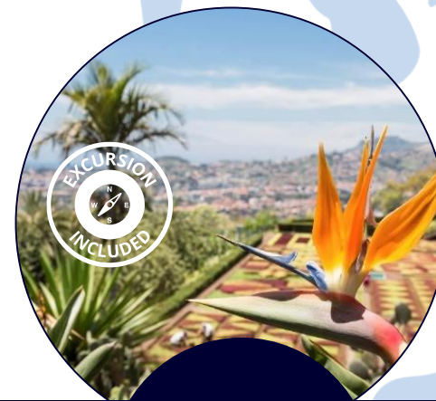
Funchal / Madeira Portugal