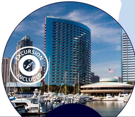
San Diego USA