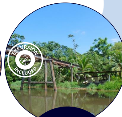
The Tortuguero Canal Costa Rica