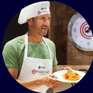
Masterchef at Sea