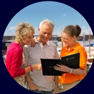
Local History and Culture Lectures