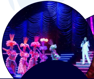
Teatro Carlo Felice with Shows

Enjoy international shown and activities related to the destinations you visit.