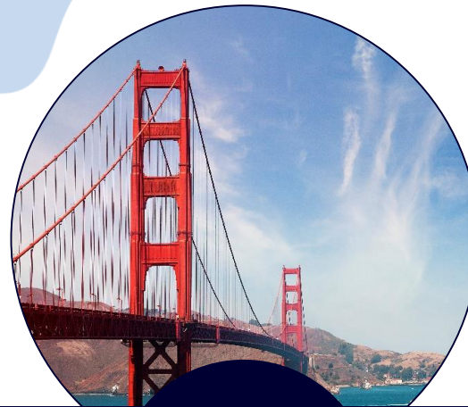
San Francisco USA