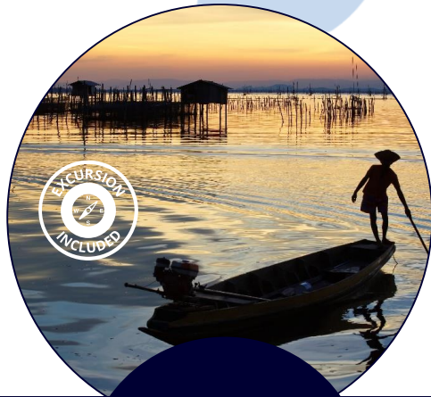
Da Nang Vietnam