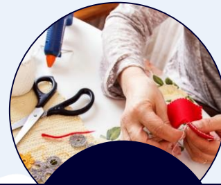
Arts & Crafts, Photography Classes