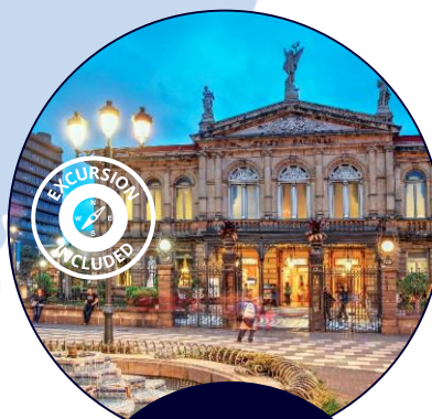
Puntarenas Costa Rica