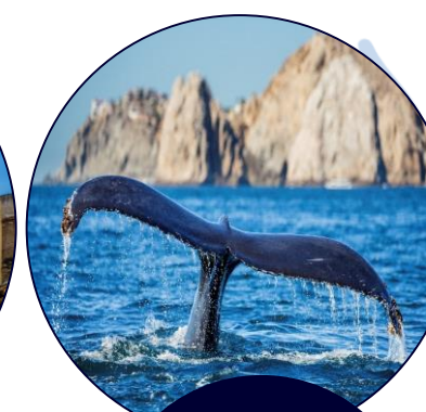
Cabo San Lucas Mexico