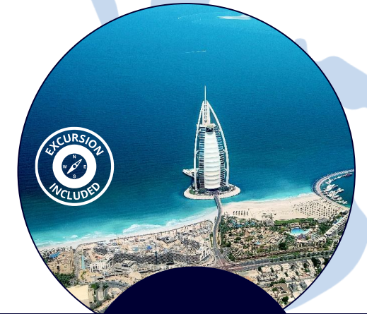
Dubai United Arab Emirates

Petronas Towers & lunch in Kuala Lumpur Tower