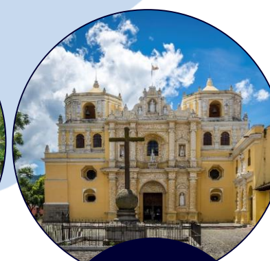
Puerto Quetzal Guatemala