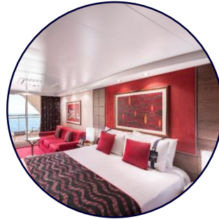
Cabins & Suites