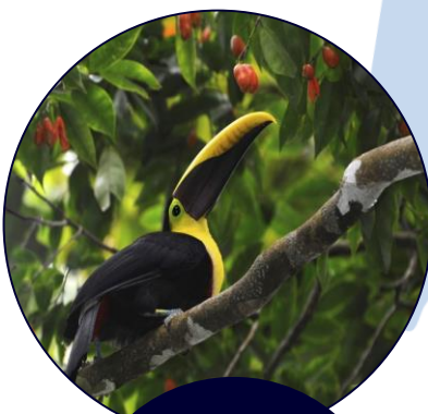
Puerto Limon Costa Rica