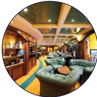
Bars & Lounges