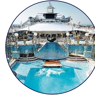
Pools & Spa