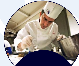
Classes in cooking