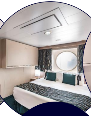
Outside with Partial View