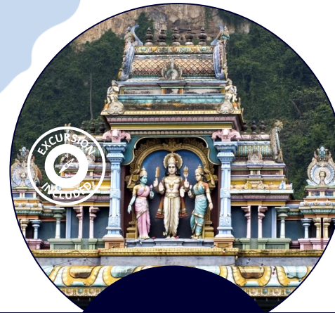
Port Klang Malaysia

Petronas Towers & lunch in Kuala Lumpur Tower