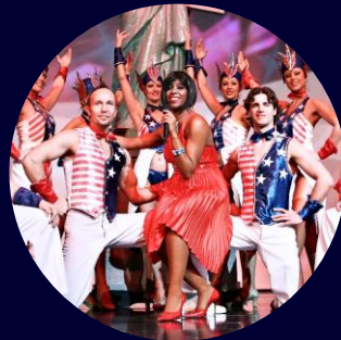
Dancers, Singers, Artists and Musicians Live Performances